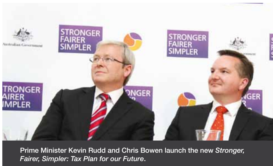
Prime Minister Kevin Rudd and Chris Bowen launch the new Stronger, Fairer, Simpler: Tax Plan for our Future .

Chris Bowen, as the Minister for Superannuation, recently announced changes that will deliver an historic boost to Australians' retirement savings.