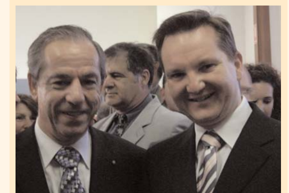
The Maltese Prime Minister and Chris Bowen.

Chris welcomed Dr Gonzi as the local member and as vice chairman of the Parliamentary friends of Malta.