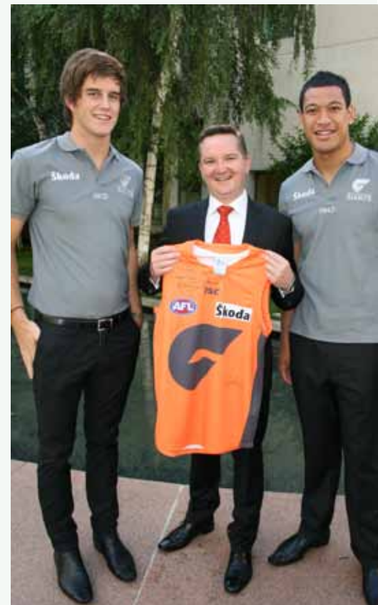
L-R: Josh Bruce, Chris Bowen, Israel Folau.

For more information on the team, go to www.gwsgiants.com.au