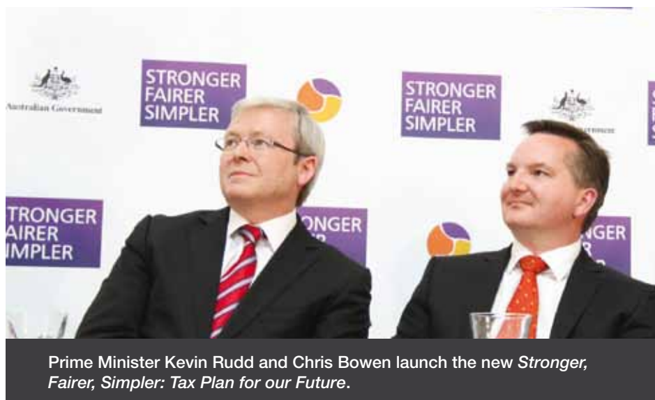
Prime Minister Kevin Rudd and Chris Bowen launch the new Stronger, Fairer, Simpler: Tax Plan for our Future .

Chris Bowen, as the Minister for Superannuation, recently announced changes that will deliver an historic boost to Australians' retirement savings.