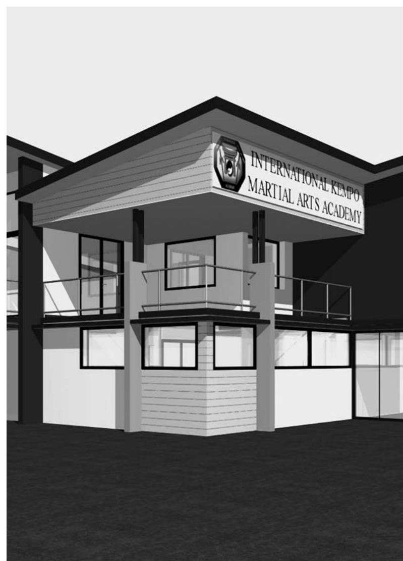
New international Kempo academy to be built at Kemps Creek

The new centre will be built on Bill Anderson Reserve at Kemps Creek and replace the old derelict tennis courts. The centre will occupy close to 1000 square metres and will be a purpose built venue for Martial Arts competitions making the only one of its kind in the country. It will also be used as a community centre where the local residents could use it for a variety of different purposes (parties etc). It will also be used by the local schools as part of their sport program and it will be used by the ASC for the Active After School Program. It will be the first major development in the Kemps Creek area in 30 years.