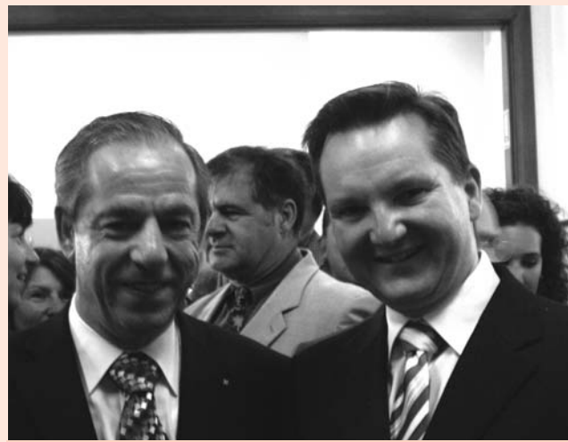
The Maltese Prime Minister and Chris Bowen.

Residents in Western Sydney were recently treated to a visit by The Maltese Prime Minister Dr Lawrence Gonzi.