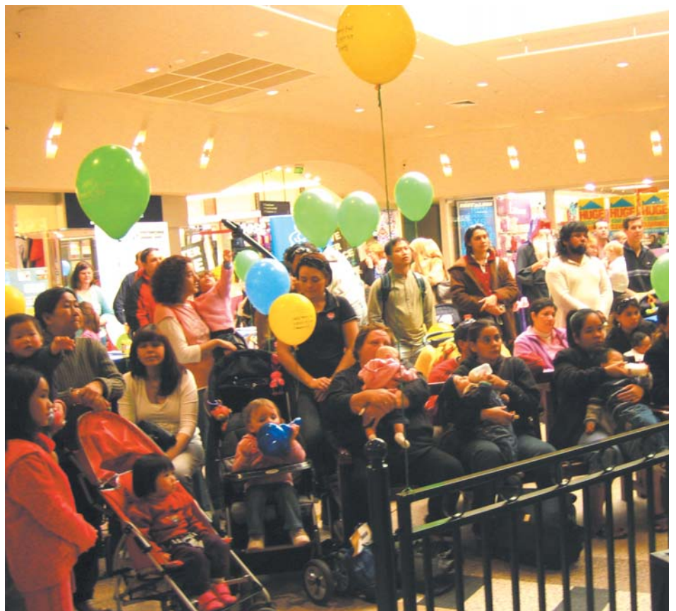
BABIES, PARENTS AND CARERS enjoying our second annual Welcoming the Babies celebrations.

Look out for Welcoming the Babies 2008 ... it'll be even bigger and better!