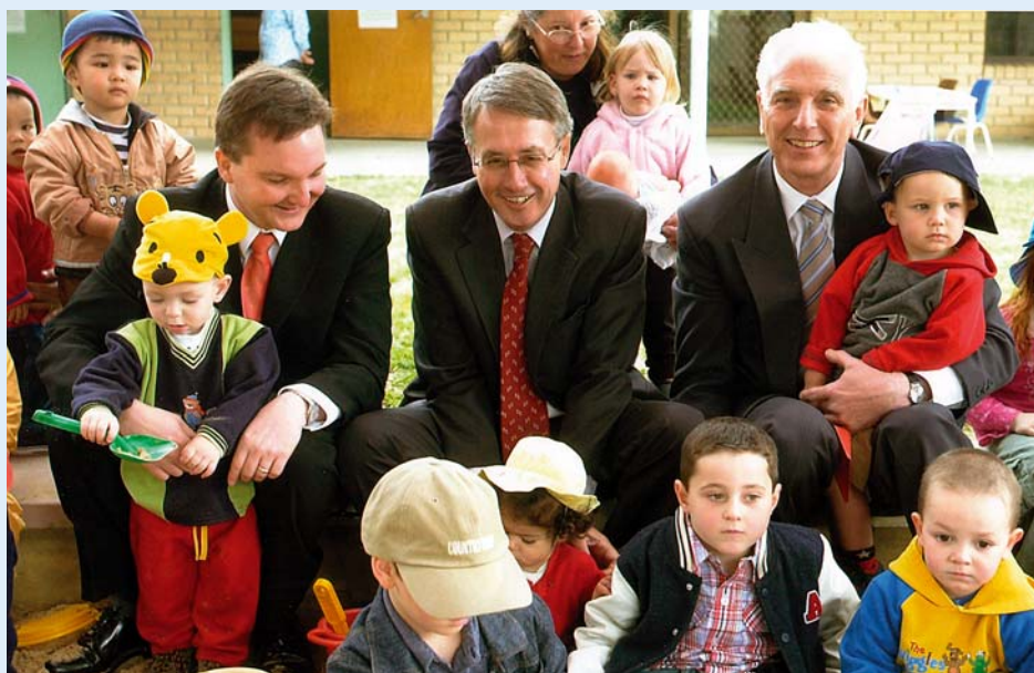
TACKLING THE CHILDCARE CRISIS: Chris Bowen with Labor's Shadow Treasurer Wayne Swan (centre) at a local childcare centre.

Labor would also look to put extra resources into the Net Alert program to promote Internet safety and strengthen ties with international law enforcement to bring publishers of illegal content to justice.