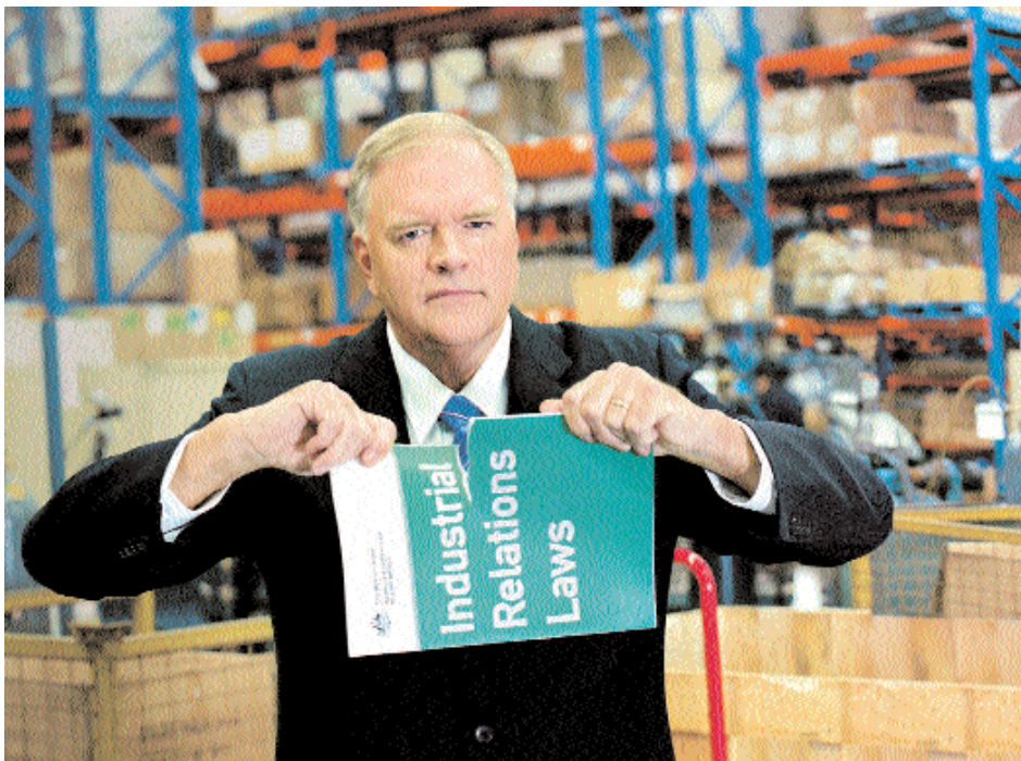
FIGHTING FOR JOB SECURITY: Kim Beazley and Labor are fighting to protect workers' rights, jobs and wages against attacks from the Howard Government.

If you have any feedback or questions about Labor policies, please feel free to get in contact with me by phone, letter or email.