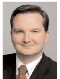
Chris Bowen Federal Member for Prospect

A handwritten signature in blue ink that reads 'Chris Bowen'.