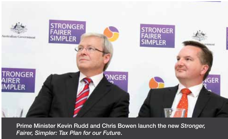
Prime Minister Kevin Rudd and Chris Bowen launch the new Stronger, Fairer, Simpler: Tax Plan for our Future .