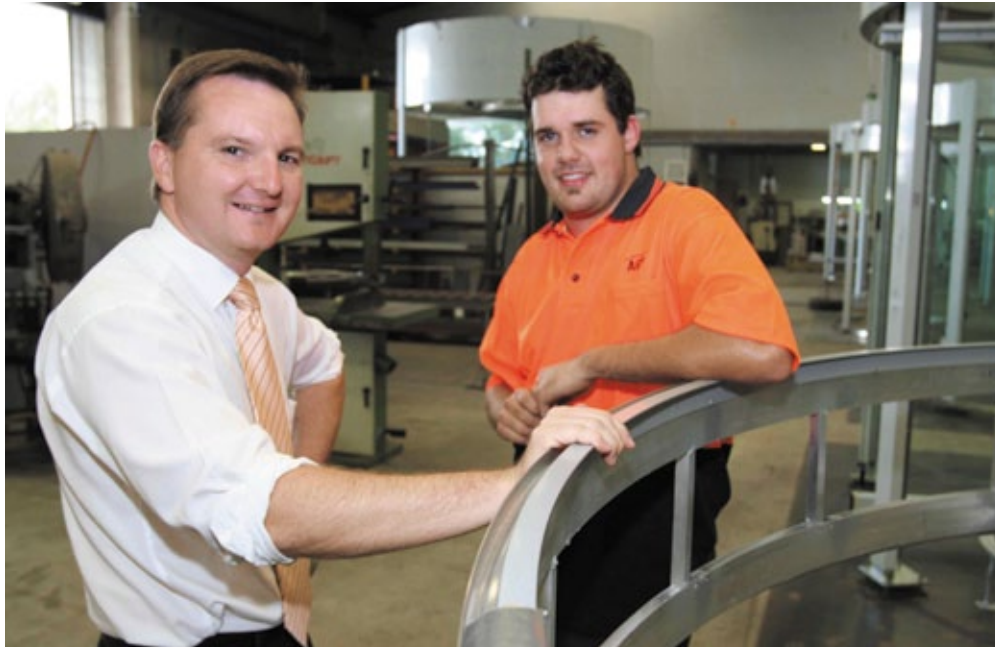
The new Fair Work laws will ensure fairness and balance in the workplace.

On 1 January 2010, the Rudd Government delivered on its promise to get rid of Work Choices. We established the Fair Work System - a fair and balanced national workplace relations system.