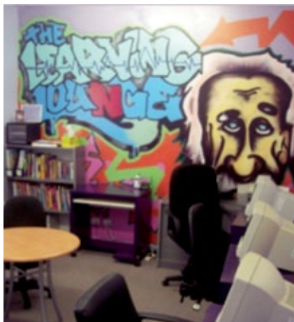
The Learning Lounge Homework Centre at St Clair Youth Centre

Please call 9834 2708 if you may be interested in more information.